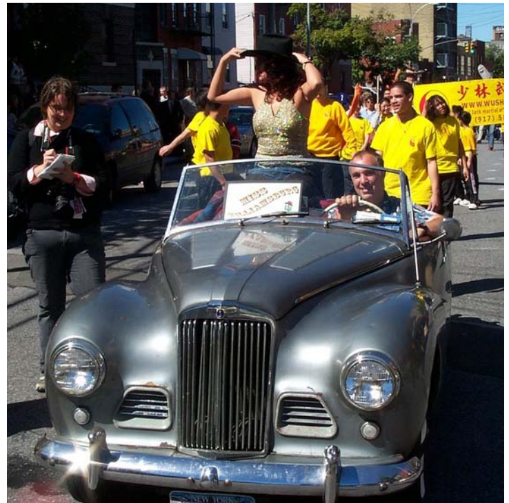
Driving Miss Williamsburg in the local pet parade

service manager of Rootes Motors in Long Island City. It also was basically a barn find (with very low mileage—9000 miles) when I got it. I did the same mechanical work that was required on my 53. It's been to several United's. I recall one in the Carolina's, one in Maryland, and another in Daytona Beach, Florida.